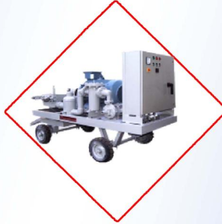
High Pressure Triplex Plunger Pump