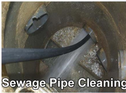
Sewage Pipe Cleaning