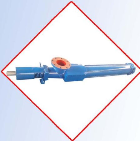
Single Screw Pump