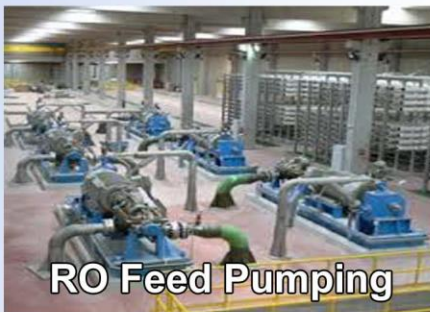
RO Feed Pumping