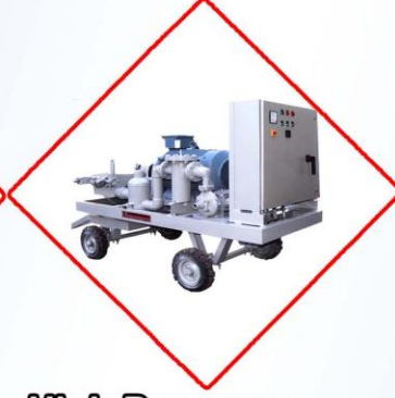
High Pressure Triplex Plunger Pump