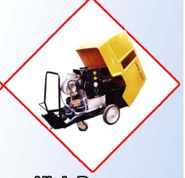
High Pressure Jet Cleaning Machine