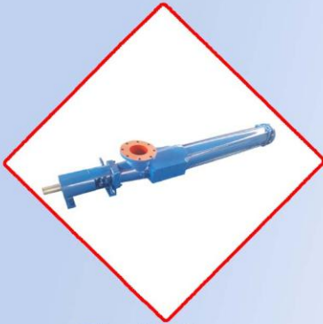
Single Screw Pump: EH Model