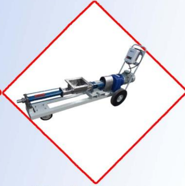
Single Screw Pump : ER Model