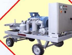
High Pressure Triplex Plunger Pump