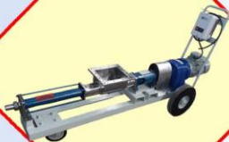
Single Screw Pump for High Viscous Liquid