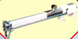
Quick Cleaning Single Screw Pump