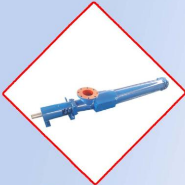
Single Screw Pump