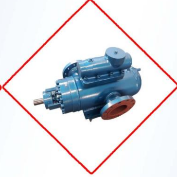
Triple Screw Pump