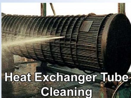
Heat Exchanger Tube Cleaning