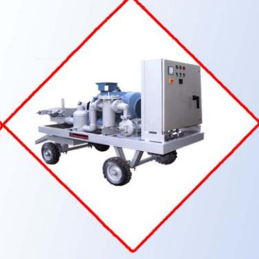
High Pressure Triplex Plunger Pump