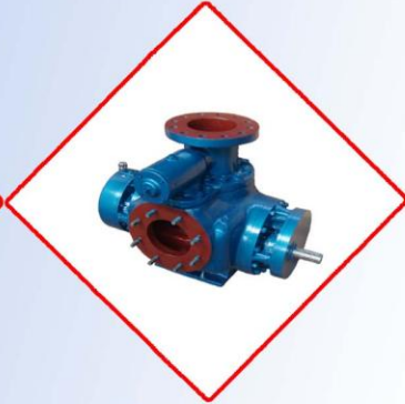
Twin Screw Pump