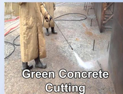
Green Concrete Cutting

14/7 Mathura Road, Faridabad-121003, Haryana (India) Tel: 0129-4045831/0129-4046882, Email: sales@utpsl.in, Website: www.utpumps.com