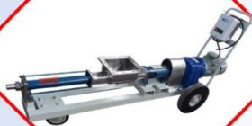
Single Screw Pump : ER Model