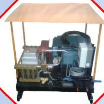
High Pressure Jet Cleaning Machine