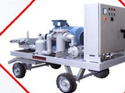
High Pressure Triplex Plunger Pump